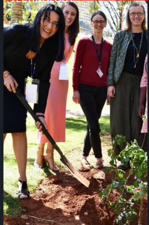
DAY 5 | UNIVERSITY OF JOHANNESBURG & WE CARE CENTRE