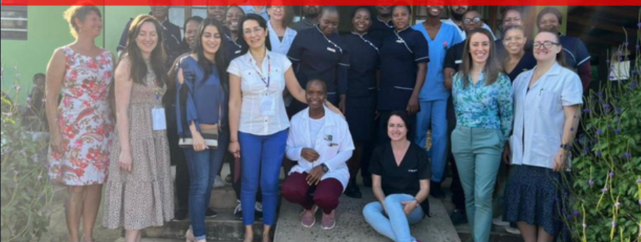
DAY 3 | KHULA NATURAL HEALTH CENTRE DAY 4 | KHULA NATURAL HEALTH CENTRE, EAST CAPE