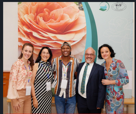
DAY 2 | DURBAN UNIVERSITY OF TECHNOLOGY